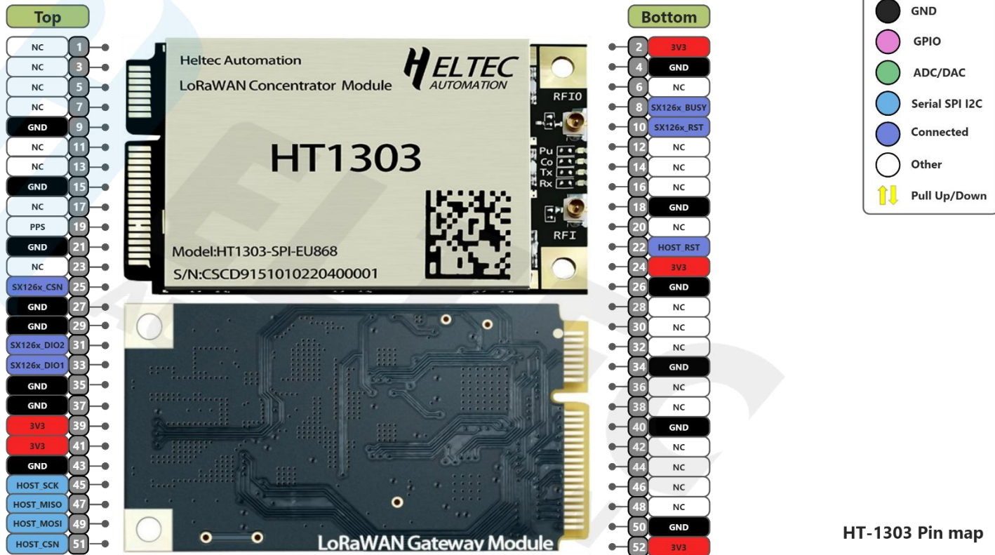
HT-1303 Pin map